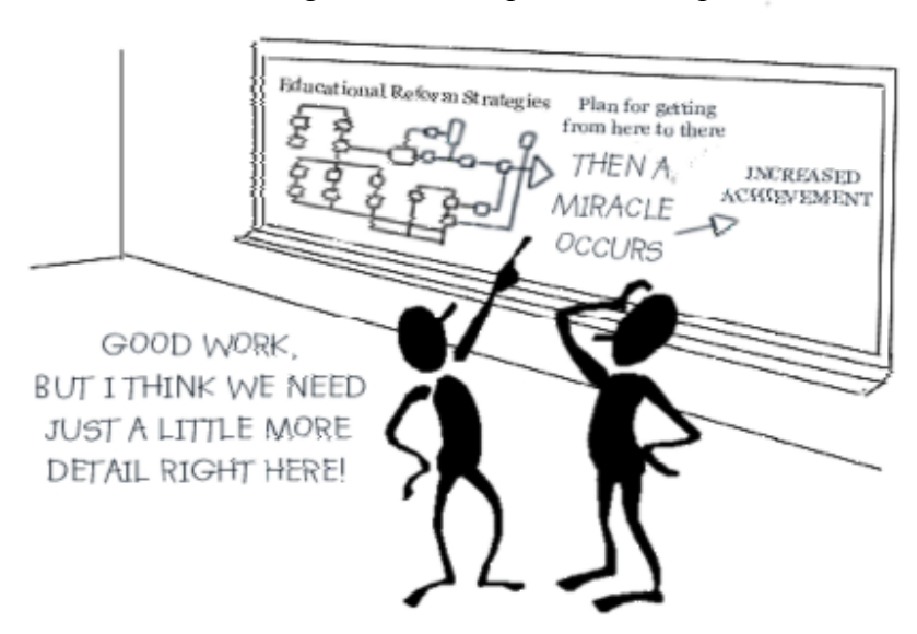
This brings us to the implementation problem.

By now, it should be clear that for schools the need is not just to add evidence-based practices; it is to do so in ways that contribute to development of a comprehensive system for addressing barriers to learning and teaching..