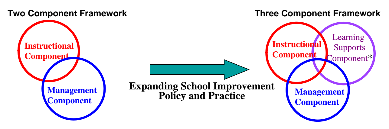
*States and districts are trending toward using the term Learning Supports for efforts to address barriers to learning and teaching.

Advocacy for ending the disorganization and effectively weaving together whatever a school has with whatever a community is doing to confront barriers to equity of opportunity should be directed at establishing a three component school improvement framework. As illustrated below, the expanded policy framework is intended to ensure a primary commitment to addressing barriers to learning and teaching.